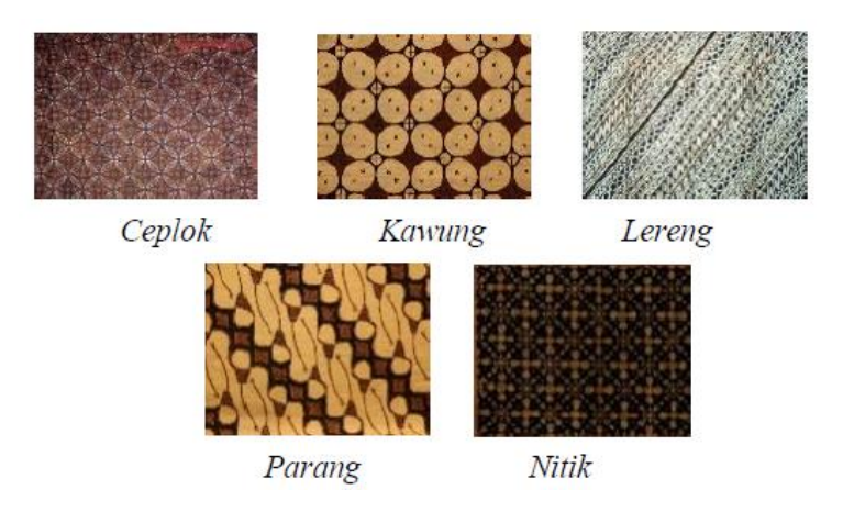
Figure 1. The instances of batik motif [12]